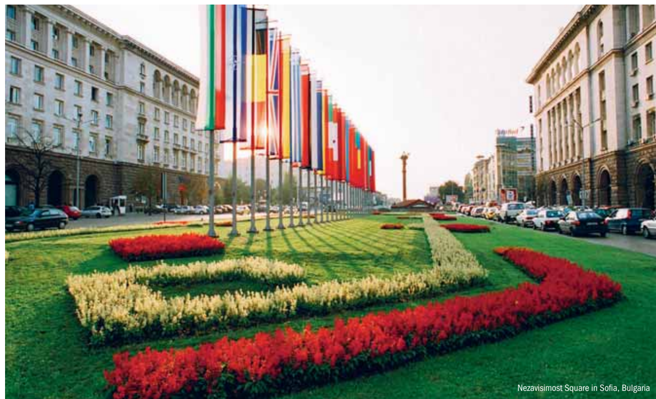
Nezavisimost Square in Sofia, Bulgaria