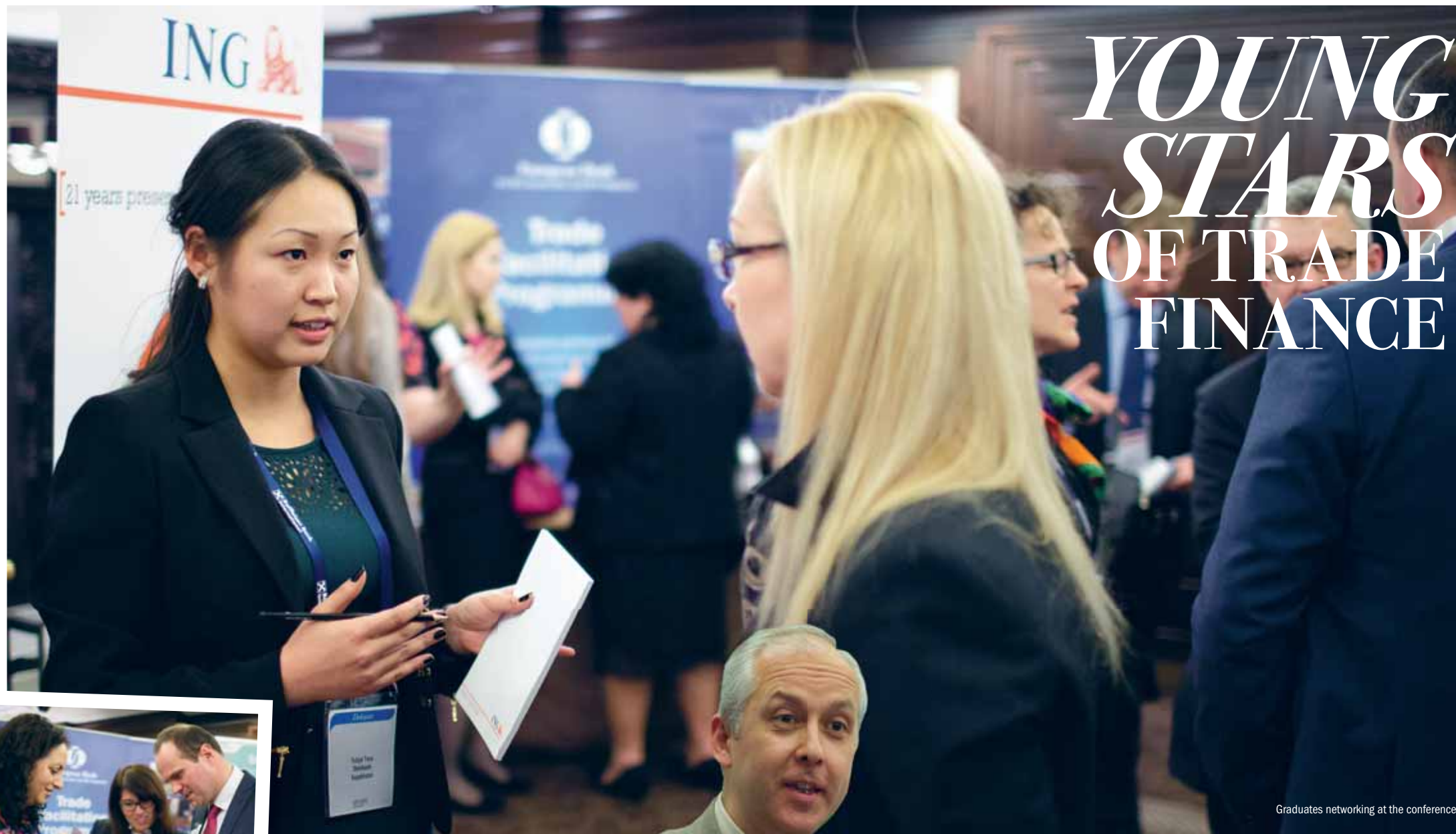
Graduates networking at the conference