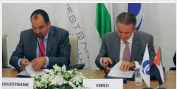
30 SEPTEMBER 2012 InvestBank, Jordan | US$ 30 million