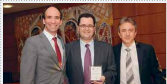
10 DECEMBER 2012 Société Générale Maroc, Morocco | €5 million