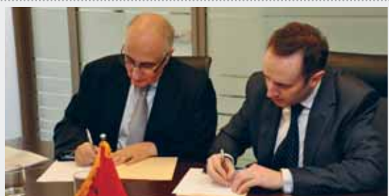
7 MARCH 2013 BMCE Bank, Morocco | US$ 75 million