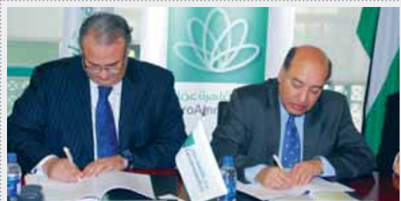
18 MARCH 2013 Cairo Amman Bank, Jordan | US$ 35 million