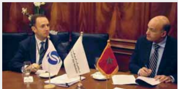
24 FEBRUARY 2014 Crédit du Maroc, Morocco | US$ 40 million