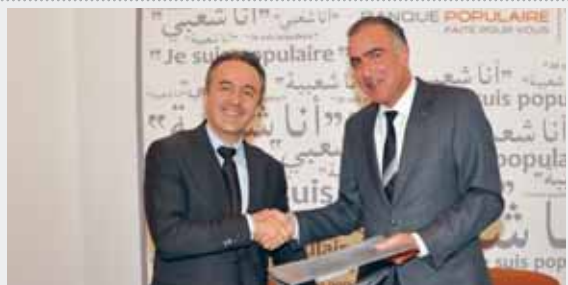
3 JUNE 2013 Banque Centrale Populaire, Morocco | US$ 50 million