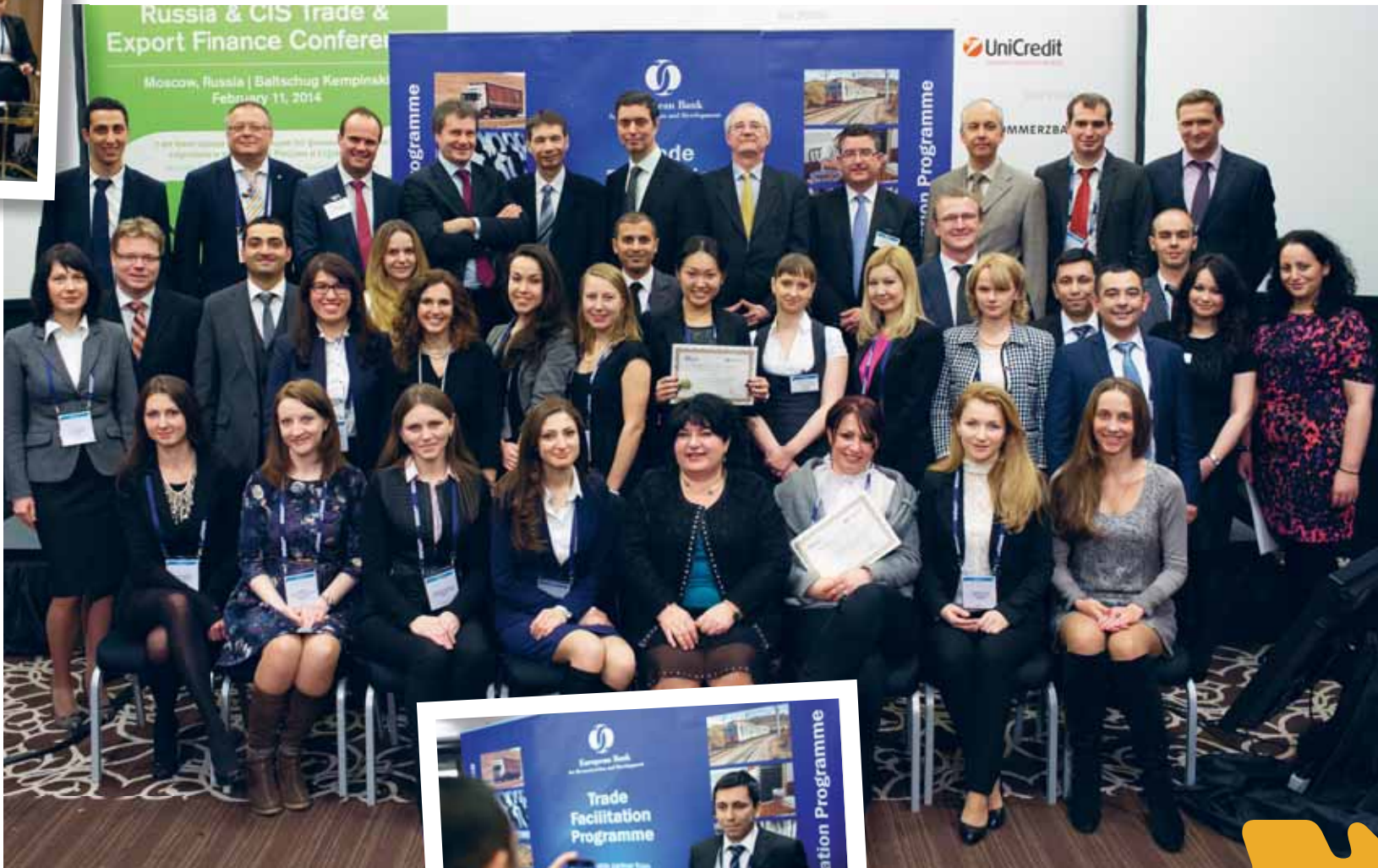
Above: The e-Learning graduates for 2014 Right: Graduates from Bank Eskhata