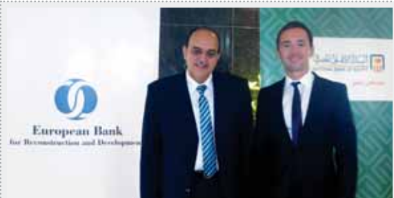
19 FEBRUARY 2014 National Bank of Egypt, Egypt | US$ 50 million

Since the start of the EBRD's expansion into the southern and eastern Mediterranean (SEMED), the EBRD has welcomed seven new issuing banks into its new area of operations.