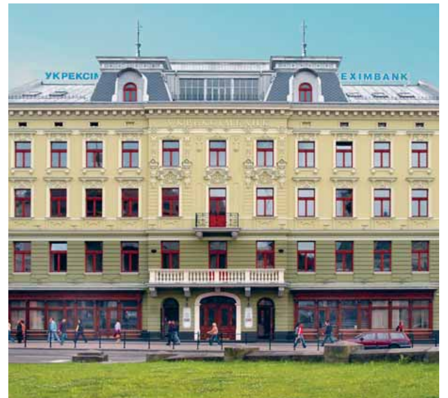
Ukreximbank's branch in Lviv

is evolving, new products are created and the range of services provided is expanding. We therefore remain open to proposals from, and further cooperation with, our key partner – the EBRD.●